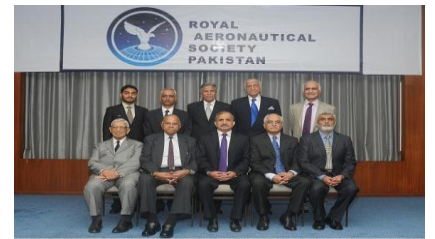
Divisional Council Members of RAeS, Pakistan Division with Air Chief Marshal Tahir Rafique Butt, Chief of the Air Staff