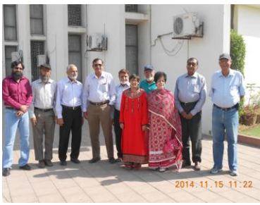
Group Photographs outside the office of SAPT