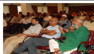
A View of Participants