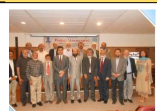
A Group Photograph