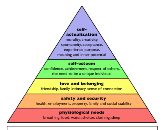
Figure 1: Maslow's Hierarchy of Need

the use of existing resources.so by improving work environment, one can in crease productivity. The work environment includes all factors that affect the workplace and job performnace even though they may not be directly involved in the operation itself. To maintain social and economic development, a healthy productive worker is very critical. Occupational health is an important strategy not only to ensure health of workers, but also to contribute productivity, quality of products ,work motivation ,job satisfaction and thereby overall quality of life or society.<sup>5</sup>