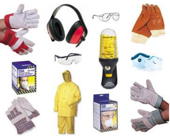
Figure 3: Personal Protective Equipment